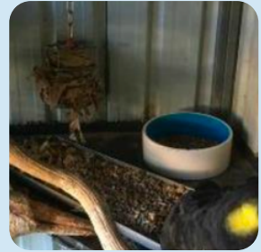
FORAGE TRAY IN AVIARY